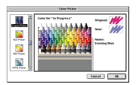
The crayon color picker provides a simple way to select colors.