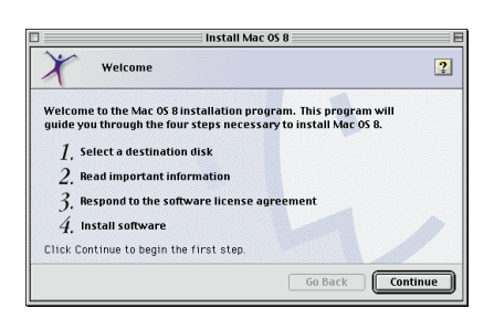
The streamlined Installer makes installation quick and easy.