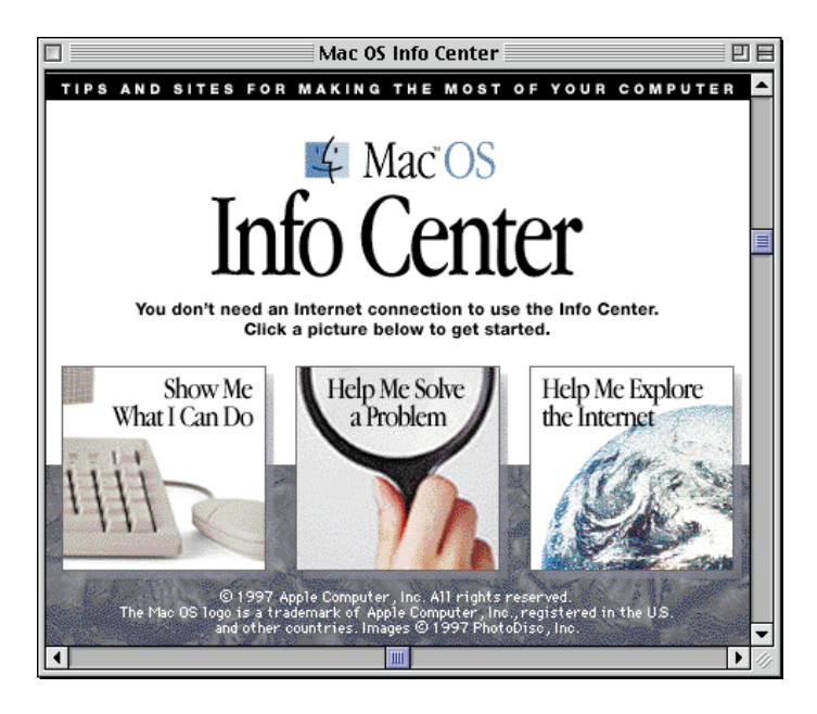
Learn how to effectively use your Mac OS computer and explore the Internet with the Mac OS Info Center.